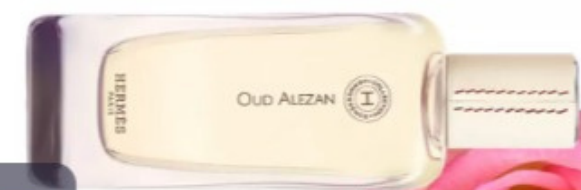
Hermès Oud Alezan eau de parfum, £283 for 100ml