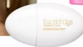
Lisa Eldridge Seamless Skin Enhancing Tint, £37