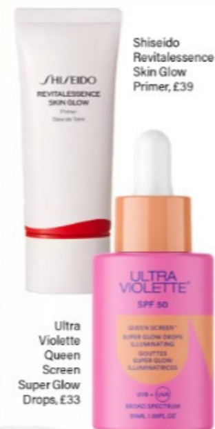
Ultra Violette Queen Screen Super Glow Drops, £33