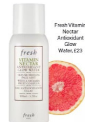
Fresh Vitamin Nectar Antioxidant Glow Water, £23